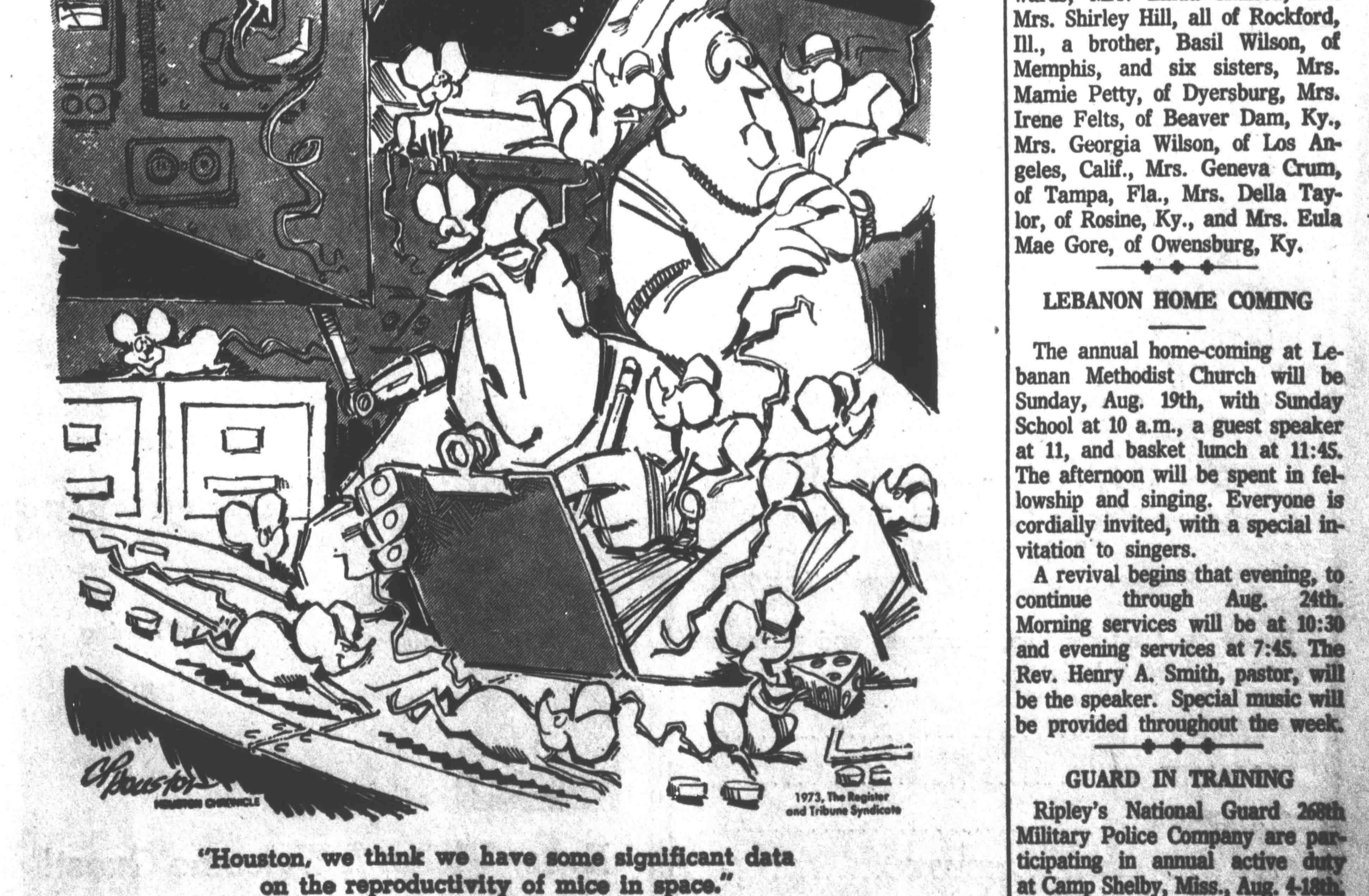
"Houston, we think we have some significant data on the reproductivity of mice in space."